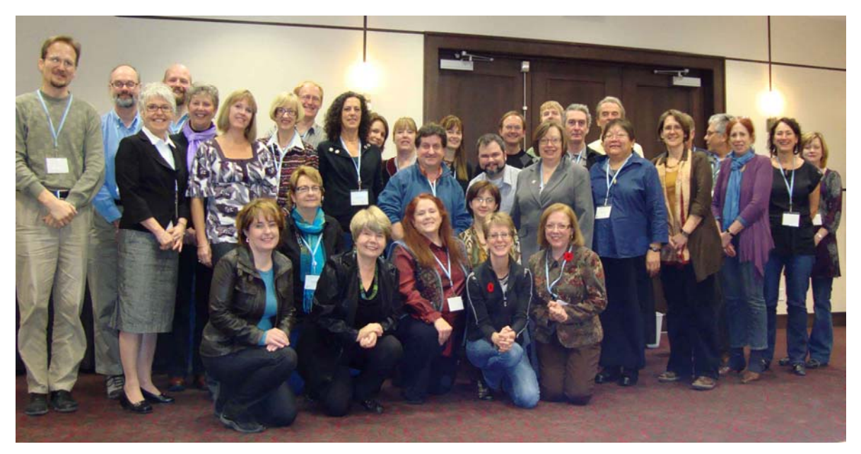
Picture from the last day of the Third Working Conference on Research in Teacher Education in Canada Winnipeg, 7 November 2009

Foremost, we like to acknowledge our colleagues who were involved in this writing and working project that we have proposed in the spring of 2009 and who came to Winnipeg from across the country to engage with their colleagues' ideas concerning field experiences in face-to-face working sessions. The number in which our colleagues responded to the project and the enthusiasm with which they participated has very much delighted us.